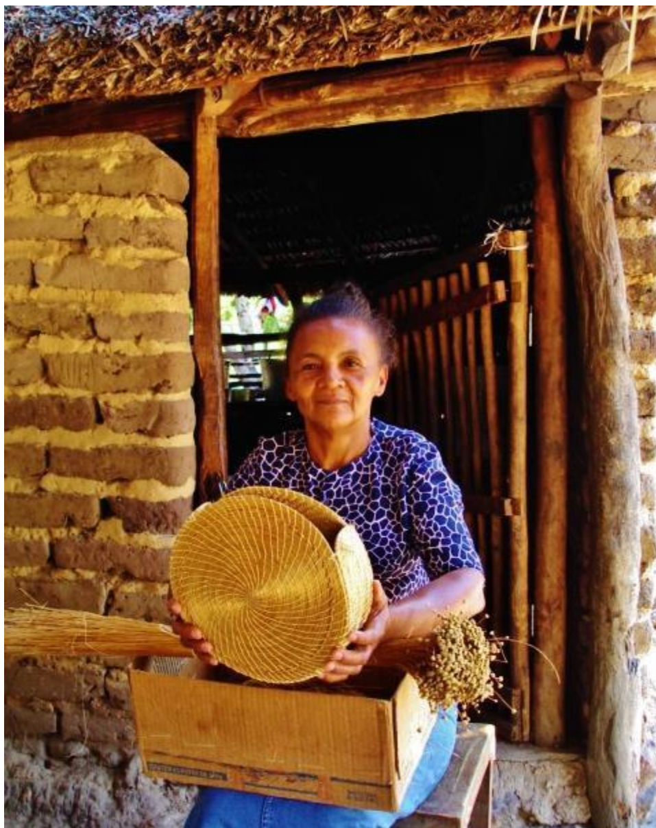
Figure 5 Empowering women by supporting their home-based sustainable craft production

Comprehensive Educational Equality: Tokenize Amazon ensures equal access to quality education for girls and boys in remote areas. Schools, resources, and campaigns counter gender stereotypes.