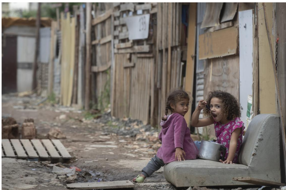
Figure 2 Ensuring Local Childhood Nutrition: The Tokenize Amazon project strives to provide nourishment for every child in the community

The Tokenize Amazon Project aligns with SDG 2 - Zero Hunger, addressing food security and environmental preservation through sustainable agriculture, community empowerment, and education.