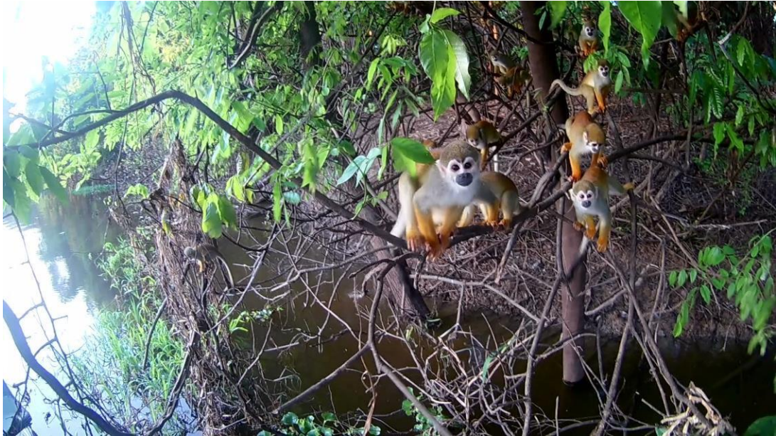
Figure 15 Preserving Amazon Monkey Habitat: Tokenize Amazon Ensuring Land Life Protection.

Conserving Amazon Biodiversity: Project's core aligns with UNSDG Goal 15, focuses on Brazilian Amazon Rainforest conservation, vital for diverse species habitats.