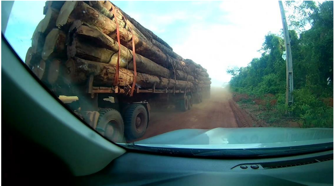
Figure 16 Combatting Illegal Loggers: Tokenize Amazon's Pursuit of Peace, Justice, and Strong Institutions.

Illegal Logging Crackdown: Project's dedication to SDG 16 evident through combatting organized crime, corruption in illegal logging. Upholds rule of law and governance.