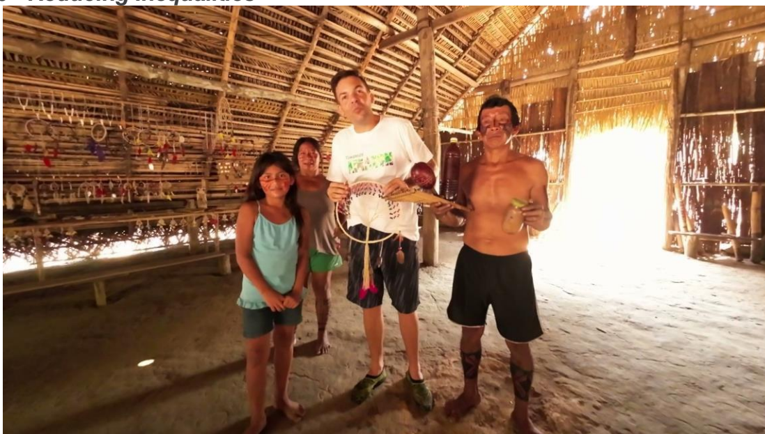
Figure 10 Inclusive engagement: Tribal community families integrated into the project, promoting reduced inequalities.

Nutrition Education and Workshops: Project integrates nutrition education into schools and outreach, reducing income-based nutritional disparities in line with SDG 10.