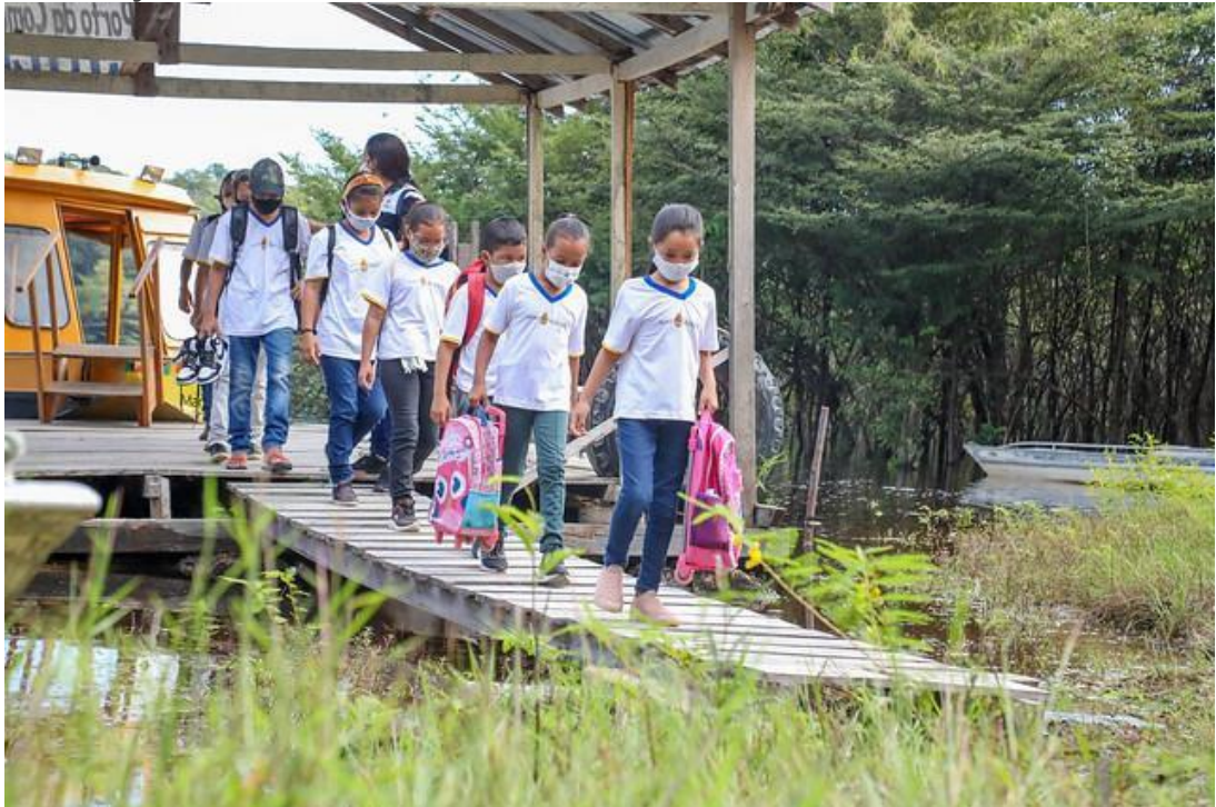
Figure 4 - Facilitating Education: Children commuting to schools via boat transportation, showcasing Tokenize Amazon's commitment to supporting education.

The Tokenize Amazon Project, resonating with the principles of SDG 4, revolutionizes education within the Amazon rainforest, emphasizing access, cultural relevance, educator empowerment, holistic support, and technology integration. These initiatives exemplify SDG 4's essence, nurturing a generation equipped for a promising future while preserving cultural heritage and ecological balance.