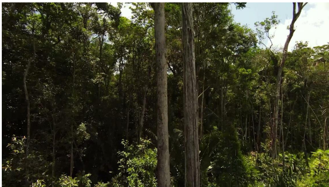
Figure 13 Preserving the Amazon Rainforest: A Project in Support of Climate Action.

Amazon's Precious Biodiversity: Largest tropical rainforest, rich biodiversity at risk due to deforestation and climate change.