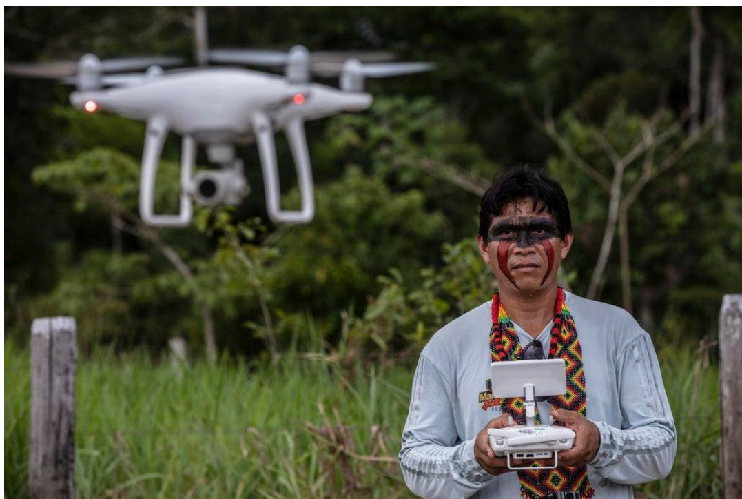
Figure 8 An indigenous Kubeua tribe member harnesses drone technology, epitomizing industry innovation and infrastructure advancements with Tokenize Amazon's initiatives.