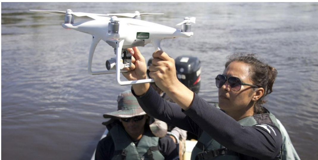
Figure 7 Empowering Skills: A local community member receives drone operation training, showcasing Tokenize Amazon's contribution to creating meaningful employment opportunities.

Holistic Economic Growth: Tokenize Amazon aligns with SDG 8, focusing on eco-tourism, agroforestry, and products for alternative income, fostering prosperity while conserving the Amazon.