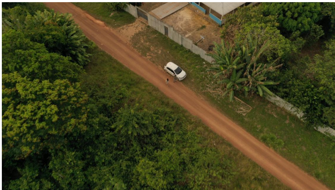
Figure 11 Strategic Conservation Efforts: Tokenize Amazon's Commitment to Combat Unplanned Deforestation for Infrastructure.

Combatting Illegal Logging for Urban Resilience: Project fights illegal logging, ensuring safe housing, resilient economies, and urban well-being, aligned with SDG 11.