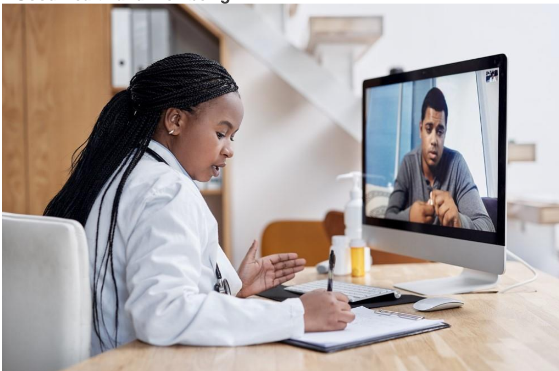
Figure 3 Empowering Remote Healthcare: Tokenize Amazon enables remote consultations for enhanced medical access.

The Tokenize Amazon Project aligns with SDG 3 - Good Health and Well-Being, leveraging technology and healthcare to bridge gaps in the Amazon rainforest. These initiatives exemplify SDG 3's vision of accessible healthcare, coupling technology with sustainable practices for a healthier Amazon rainforest.