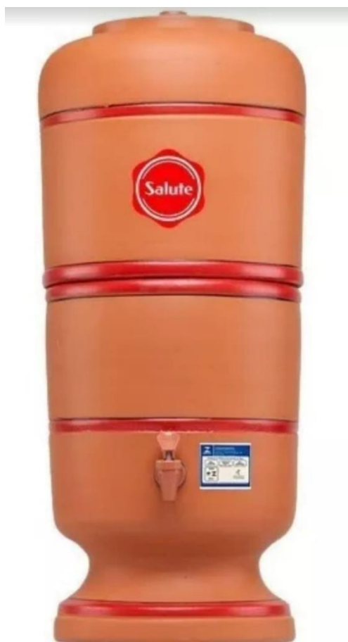
Figure 6 Type of Water Filters distributed by the Project