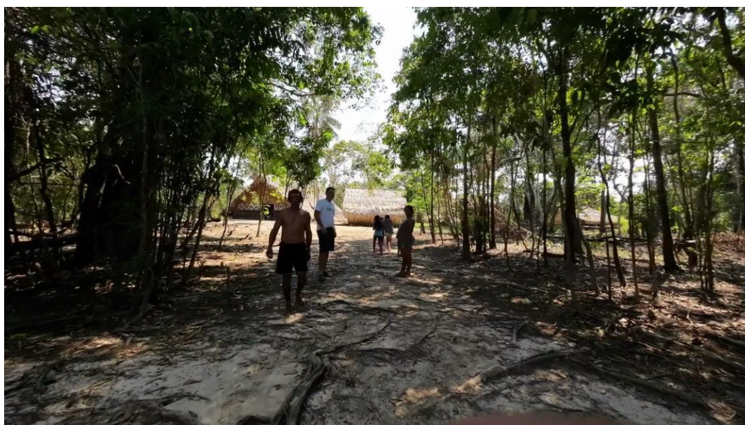
Figure 1 Collaborative Efforts: Local community members partnering with the Tokenize Amazon project for sustainable initiatives.

The Tokenize Amazon Project addresses poverty and environmental degradation within the Amazon Rainforest, aligning with SDG 1 - No Poverty, through educational empowerment, participatory engagement, livelihood skills, and sustainable agriculture.