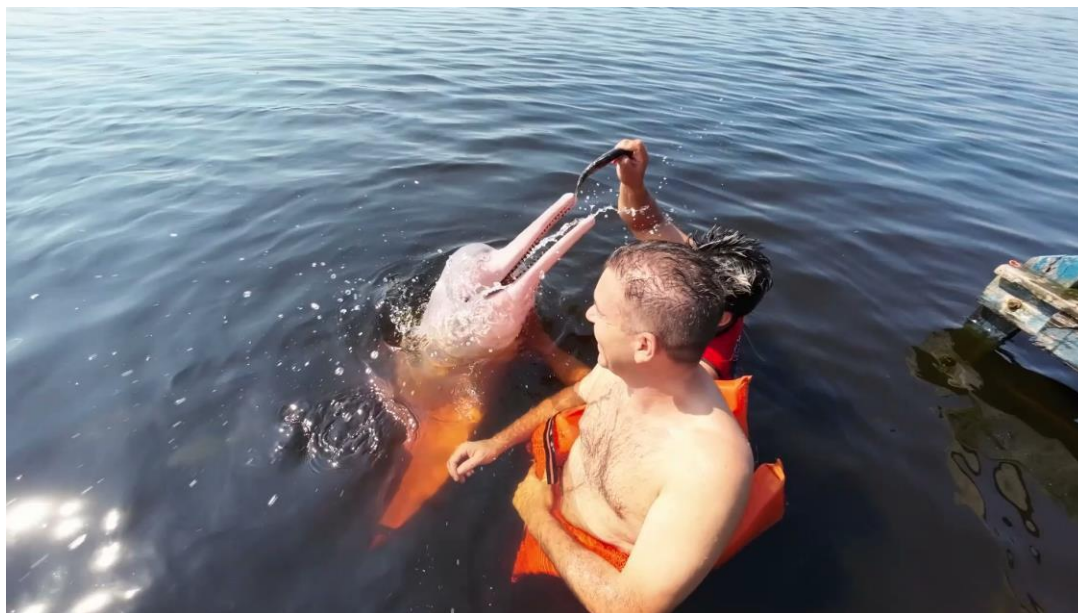
Figure 14 Safeguarding Amazon River from Pollution: A Commitment to Protecting Life Underwater, Including Amazon Pink Dolphins.

Indirect Aquatic Conservation: Project's rainforest conservation indirectly supports aquatic ecosystems, maintaining ecological balance for rivers and streams.