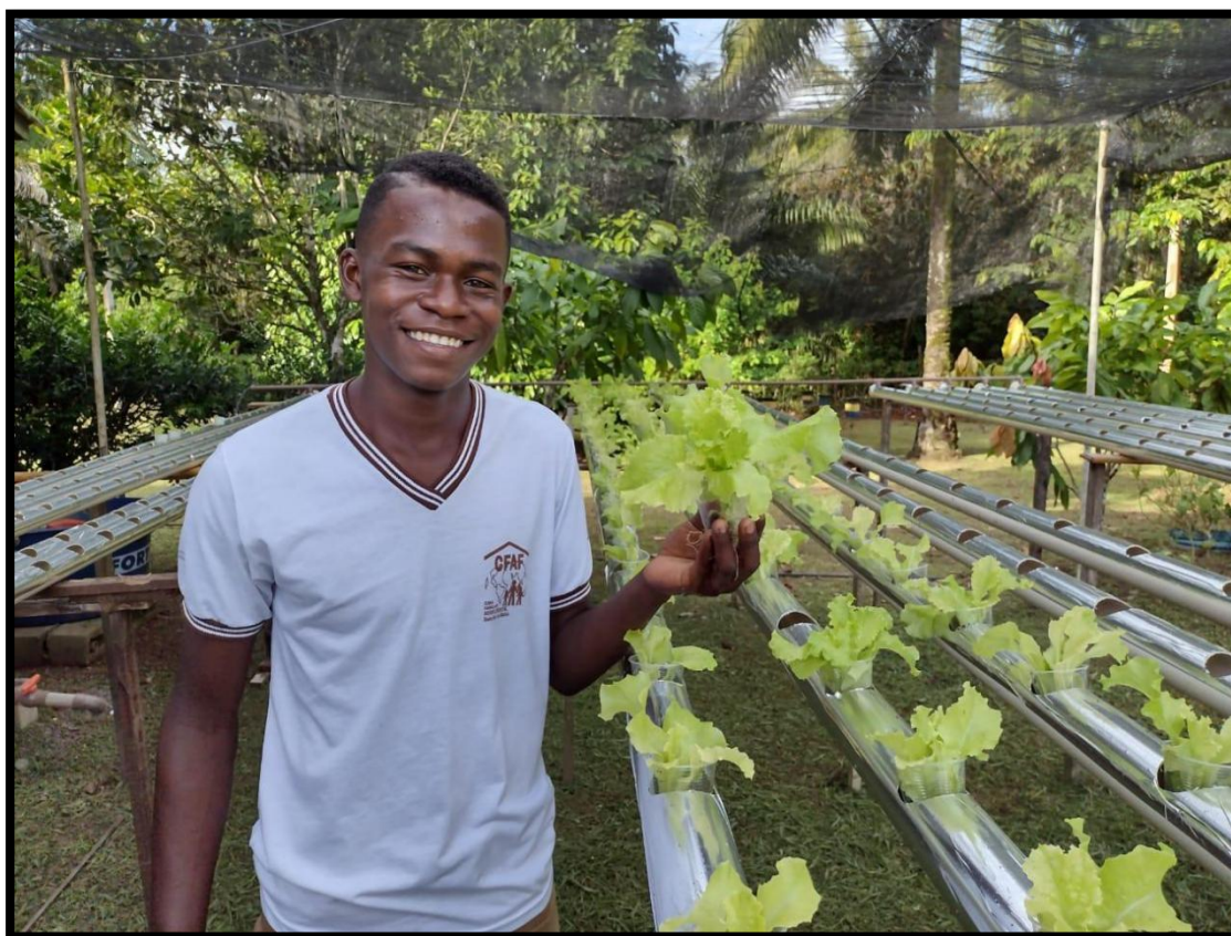
Figure 12 Empowering Local Farmers: Engaging in Hydroponic Farming for Responsible Consumption and Production with Tokenize Amazon.

Hydroponic Farming to Counter Deforestation: Project shifts to hydroponic farming, minimizing deforestation, embracing responsible production per SDG 12.