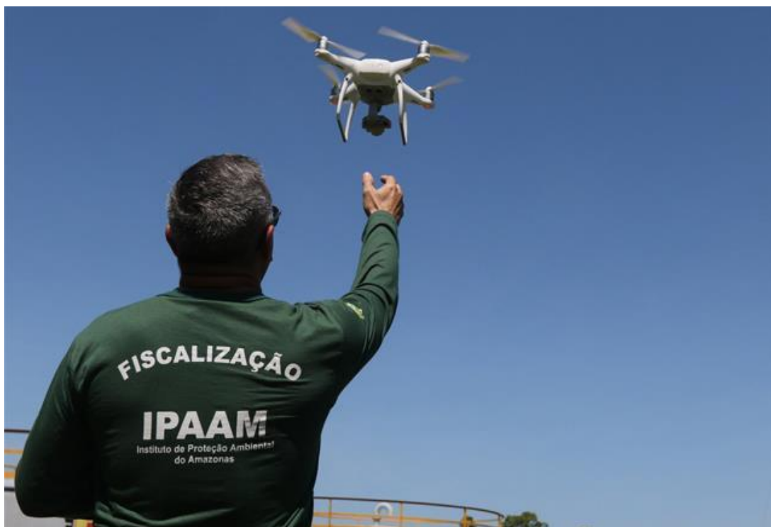
Figure 17 "Government Official Pilots a Drone: Tokenize Amazon's Collaborative Approach in Fostering Partnerships for the Goals.

Community and Indigenous Involvement: Engages local communities and indigenous leaders, empowering them in decision-making for sustainable conservation. Fosters ownership aligns with SDG 17's shared responsibility.