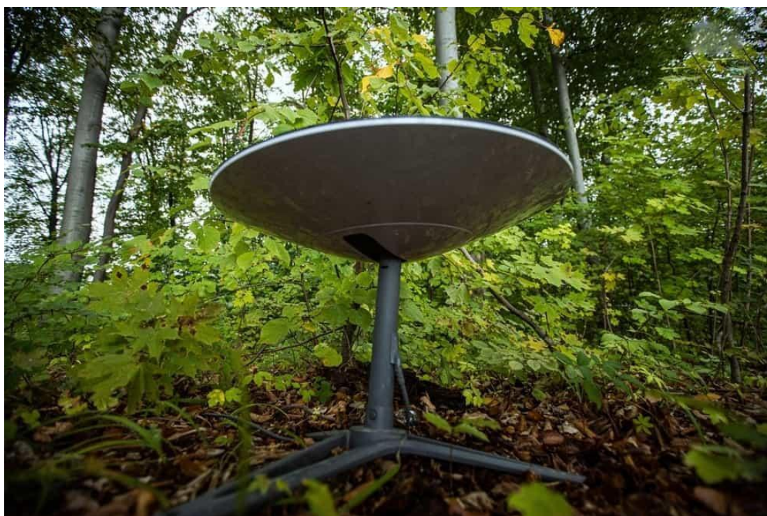
Figure 9 Satellite data for real-time monitoring and updates from the site

Drone-based Forest Monitoring: Tokenize Amazon utilizes advanced drones with LiDAR technology to map and monitor forest cover, aiding proactive conservation and combating deforestation.